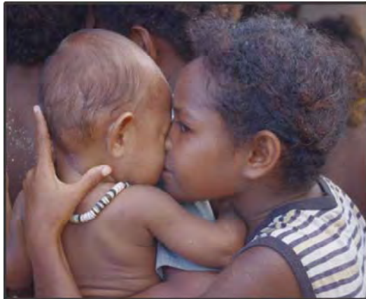
Figure 1. A Melanesian kiss (picture by author: AF)

The reason lies with the way in which Melanesian cultures traditionally perform kisses – or rather, what would be the closest equivalent to a kiss. The practice in question is typically directed at young infants, and expresses affection. Rather than involving the lips as in Europe, the action involves physical contact between the kisser’s nose and the kissee’s face, along with a brief snuffing gesture; see Figure 1. Codrington & Palmer (1896: 124) thus gloss Mota pupun as “to snuff at, in the native way of kissing an infant”.